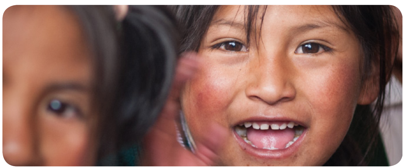
Bolivian girl at an anti-trafficking workshop, learning how to protect herself.

Building on these successes, World Vision, Tigo and the government are currently planning a second phase of the partnership, which will include generating data to support public policy recommendations to enhance the online safety of children in Bolivia.