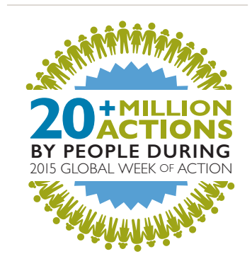
Figure 4. Reach of World Vision's previous global campaign, Child Health Now