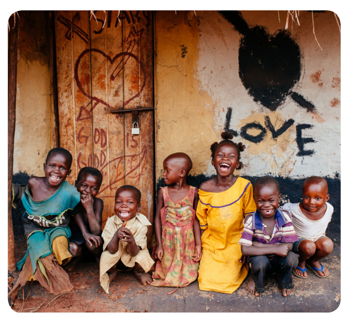
Children in Mukono District, Uganda, where World Vision has a programme to protect children from child sacrifice.

World Vision is a Christian relief, development and advocacy organisation dedicated to working with children, families and communities to overcome poverty and injustice. Inspired by our Christian values, we are dedicated to working with the world's most vulnerable people. We serve all people regardless of religion, race, ethnicity or gender.